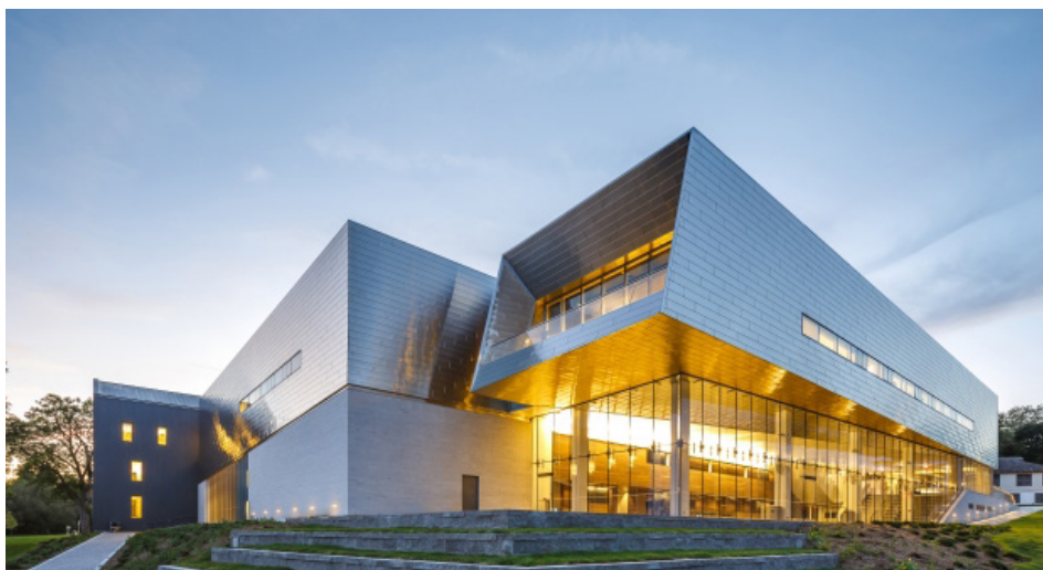
Isabel Bader Centre for the Performing Arts.

We encourage all students to apply for external funding from OGS, SSHRC, and other sources. Queen's will automatically issue a one time $5,000 award to incoming Master's students who have won federal government Tri-council awards. For more information on many external awards, see the School of Graduate Studies and Postdoctoral Affairs' information on awards and scholarships.