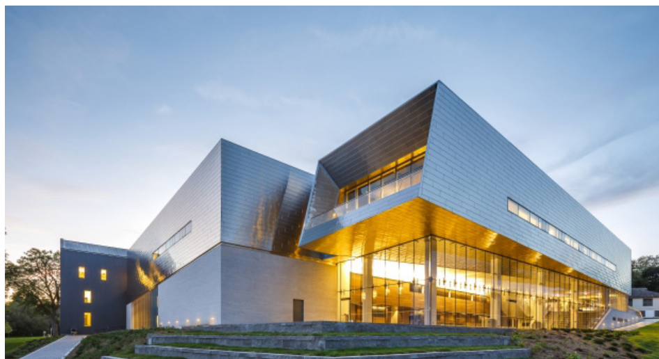
Isabel Bader Centre for the Performing Arts.

We encourage all students to apply for external funding from OGS, SSHRC, and other sources. Queen's will automatically issue a one time $5,000 award to incoming Master's students who have won federal government Tri-council awards. For more information on many external awards, see the School of Graduate Studies and Postdoctoral Affairs' information on awards and scholarships .