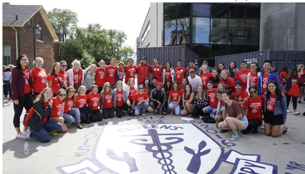
GRAD MAP FOR MSc(PT) STUDENTS

The School of Rehabilitation Therapy was established by Queen's University in 1967 to meet the needs of the local population. We continue to make active