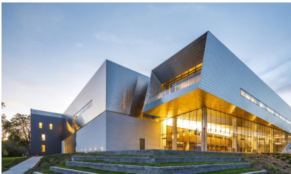
Isabel Bader Centre for the Performing Arts.

We encourage all students to apply for external funding from OGS, SSHRC, and other sources. For more information, see the School of Graduate Studies and Postdoctoral Affairs' information on awards and scholarships.