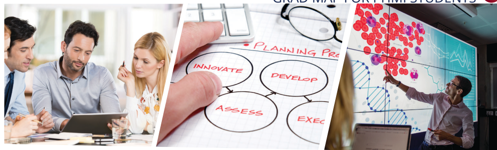
GRAD MAP FOR PHMI STUDENTS →

Graduates of this diploma will possess the knowledge and skills required to pursue advanced careers in the broader health sector, including, but not limited to, opportunities with: Federal health departments and agencies; Provincial health ministries; corporations; and entrepreneurial ventures.